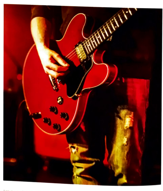
Improvised electric guitar solos are an important feature of rock anthems