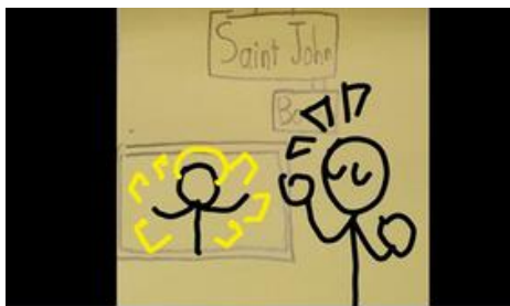
Year 7 Don Bosco Video Project from SJBC