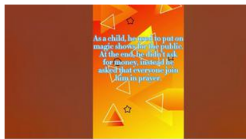
Year 7 Don Bosco Video Project from SJBC